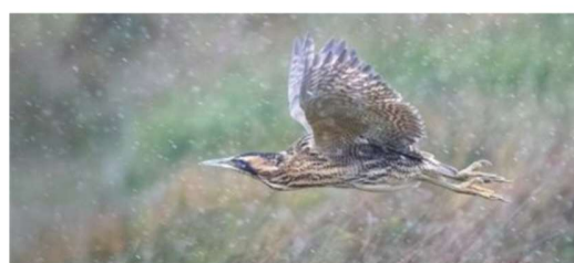
“Bittern Flying In The Rain” - Susan Buckland DPAGB (Dorchester Camera Club)

Gold medal winning prints from the WCPF Member Exhibition which will be available to view at SCC on 8 th September