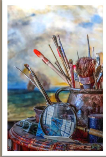
"Mr Turner's brushes" Margot Page – 2 nd Place - Digital