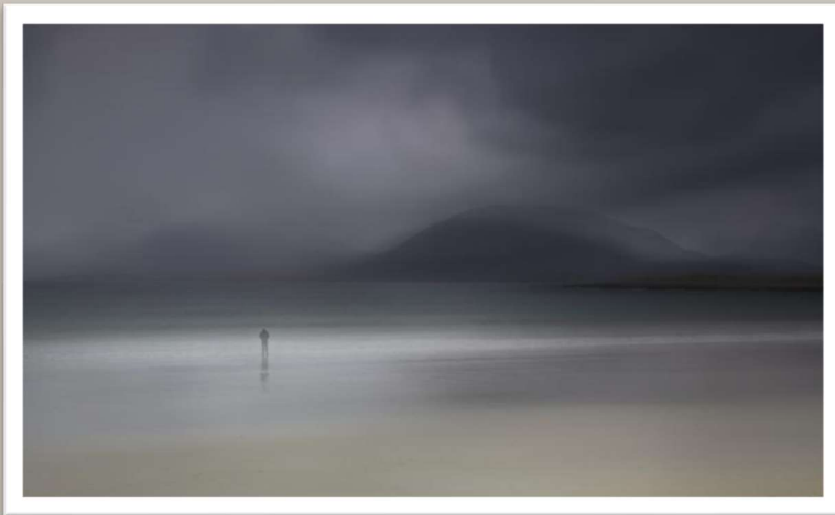
"Contemplation" – Andy Harbin 3 rd Place - Digital