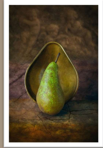
"Pear" Geoff Perrett – HC - Digital