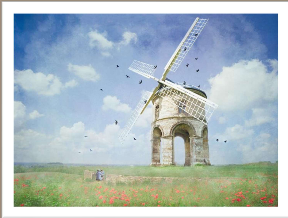
“Windmills of my mind” – Trish Bloodworth – 1 st Place