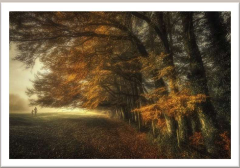
Autumn beeches – Annie Blick Highly commended - Digital